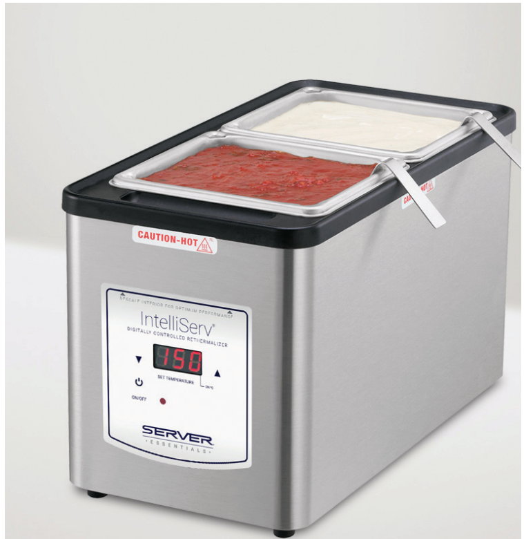
Shown: 1/6-pans and ladles